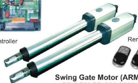
Swing Gate Motor (ARM) SP ACM SD 300 / 500