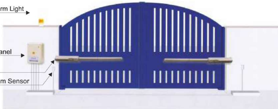
Photo Beam Sensor